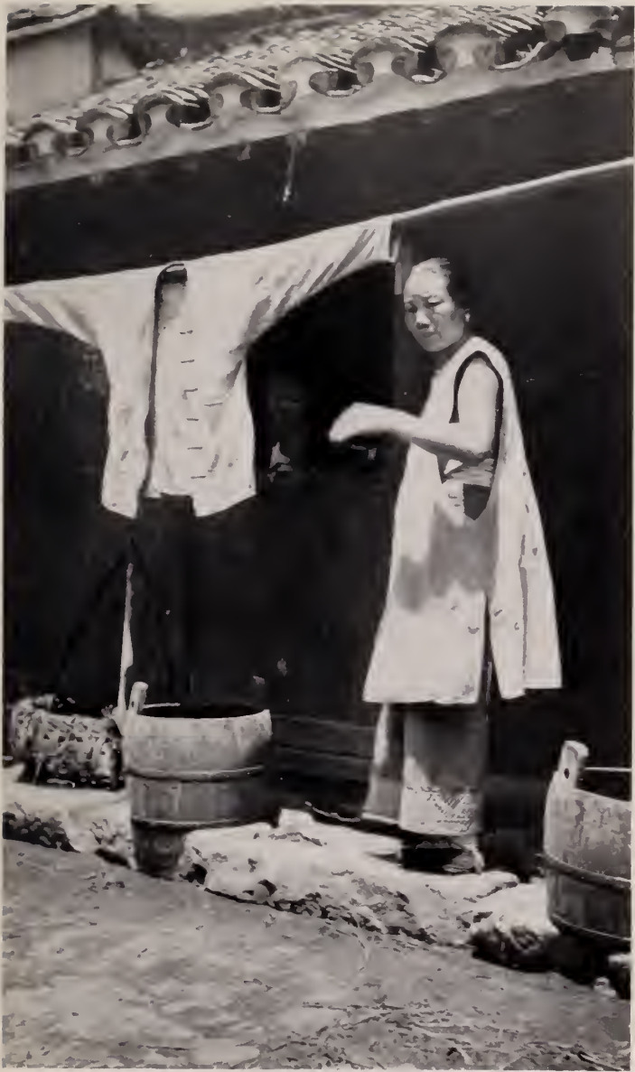
The wife of a Chinese farmer on wash-day